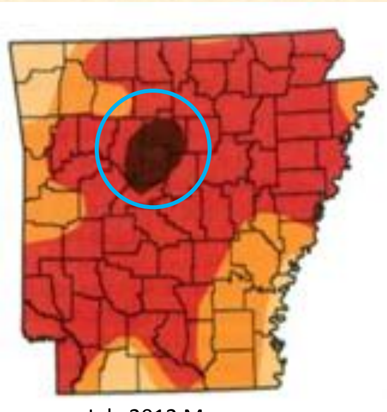
July 2012 Map